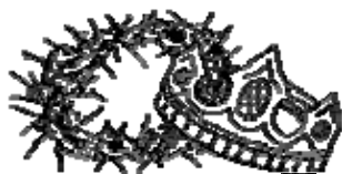
CHRIST AS SEEN IN THE BOOK OF TITUS